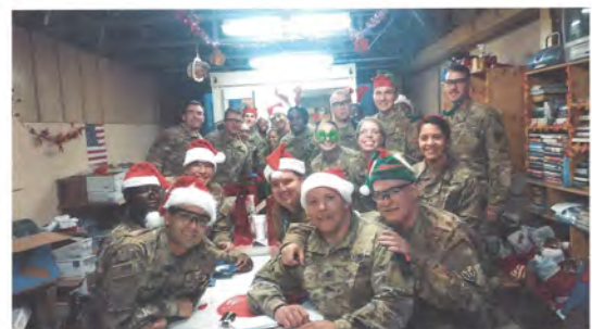
Des unit was getting Christmas shopping for the local children